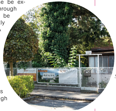
What is planned?

Ambros-Riedergasse to be closed to through traffic and converted into a pedestrian zone . The existing roadway there would then be sufficient for the use of all road users and not a single square metre of grassland would have to give way, let alone be expropriated. The through traffic would thus be transferred directly to Wienergasse. A driving ban except for residents and cyclists is also a conceivable possibility. What is needed is an overall concept with the aim of guiding as few cars as possible through Perchtoldsdorf.