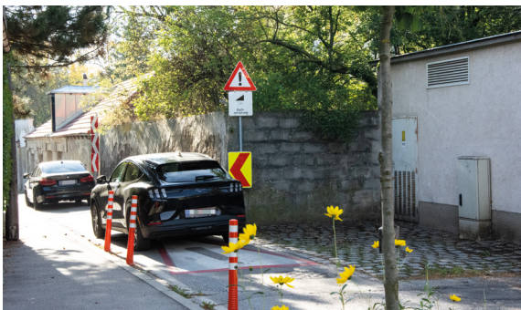
The sad reality

If the OEVP and the Greens have their way, the possibility should be created to widen Ambros-Riedergasse in the area of the narrow section in front of Wiener Gasse. From the current width of 4.5m to 7.5m. So that, according to the responsible Green deputy mayor Apl and the OEVP mayor Andrea Kö in chorus, „prams, cyclists and wheelchair users“ can use this bottleneck more safely - in addition to the 2,000 or so cars a day that use the cut-off from Plaettenstrasse to Wiener Gasse. Sounds convincing, doesn't it? A green deputy mayor is in favour of additional sealing - which is what a road widening by 3m means - and willingly supports the plans of the Austrian People's Party (OEVP) to further increase land consumption!