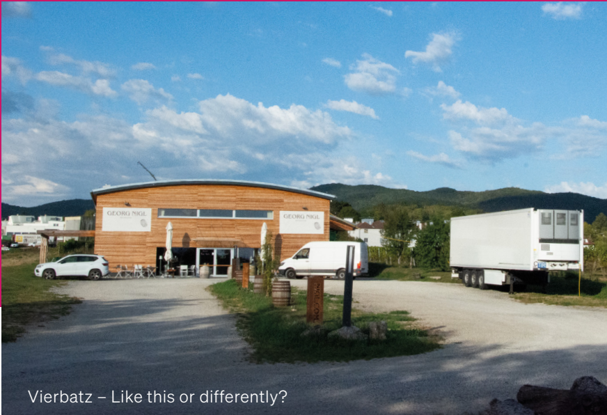
Vierbatz – Like this or differently?